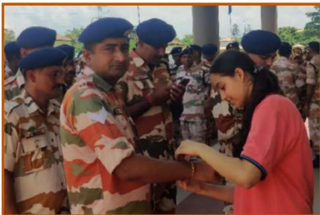
Raksha Bandhan Celebration

The initiative, aptly named "Bonds Beyond Borders: Honouring Our Soldiers," aimed to bridge the gap between civilians and the military, offering heartfelt recognition for the sacrifices made by our soldiers. This project stands as a testament to the enduring ties of love, respect, and patriotism that unite us all, transcending borders and boundaries.