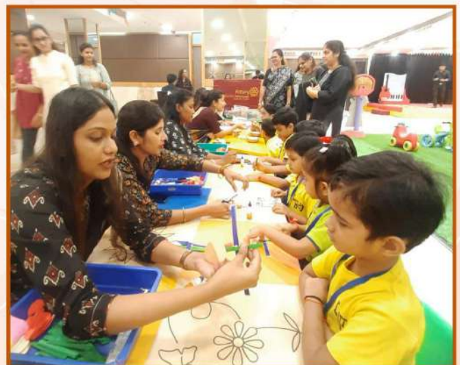
Teachers engage young children in hands on activities