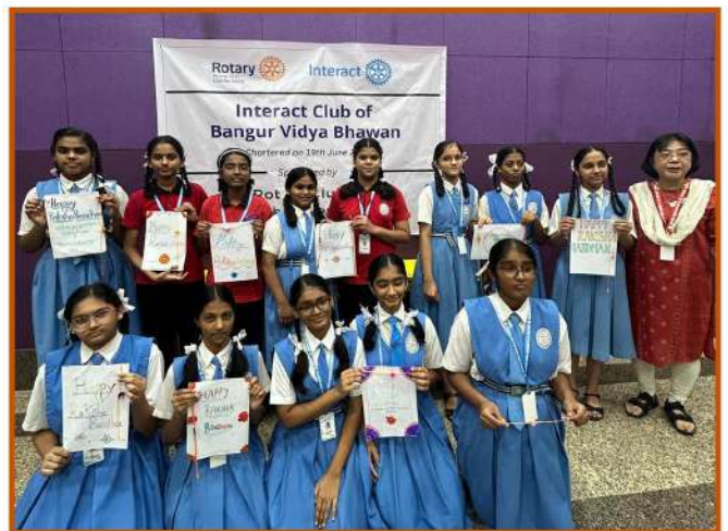
Handwritten messages of appreciation written by Bangur Vidya Bhawan students to our brave