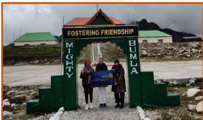
A project of Pride