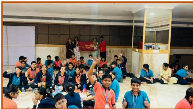
Exploring the universe one discovery at a time at Sanjeevani World School's Space Camp

Nearly 935 students participated in the camp, which was held at Sanjeevani World School, Dahisar, on the 28th, 29th, and 30th of August.