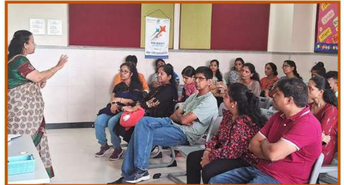
A session for the parents

Through interactive discussions and expert guidance, parents were equipped with the tools to create a nurturing environment that allows their children to spread their wings confidently, making the journey from nest to sky a joyful and fulfilling experience. Almost 146 students and 292 parents were the beneficiaries of this session.