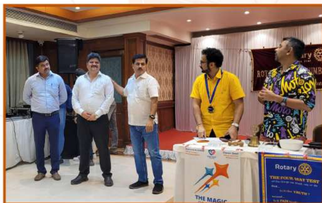
Team Umang members