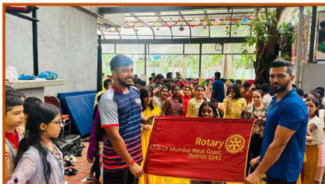
Joy, devotion, and togetherness as students and teachers celebrate the spirit of Janmashtami at Sanjeevani World School

This event truly embodied the spirit of Janmashtami, where divine energy and youthful enthusiasm merged to create an unforgettable experience for all involved.