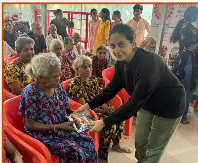
Rotarians in Action