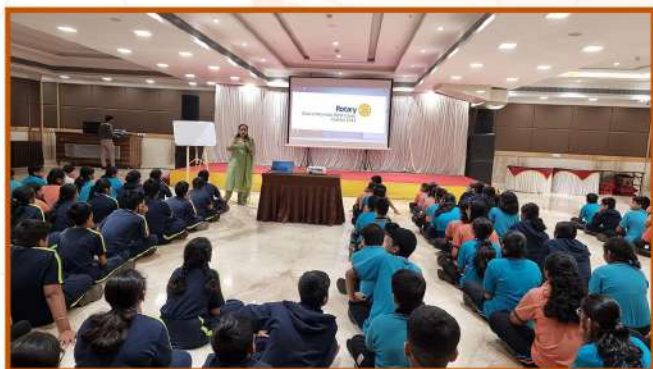
Sanjeevani World School students attending the workshop

Through interactive sessions, expert guidance, and open discussions, participants gained essential knowledge about their developing bodies, the importance of self-care, and the significance of making informed decisions. The workshop encouraged confidence and self-awareness, equipping teens with the tools they need to manage this pivotal stage of life with resilience and positivity. By fostering open dialogue and providing accurate information, the Rotary Club of Mumbai West Coast supported the holistic development of today's youth, ensuring they transition into adulthood with a strong foundation of knowledge and self-assurance.