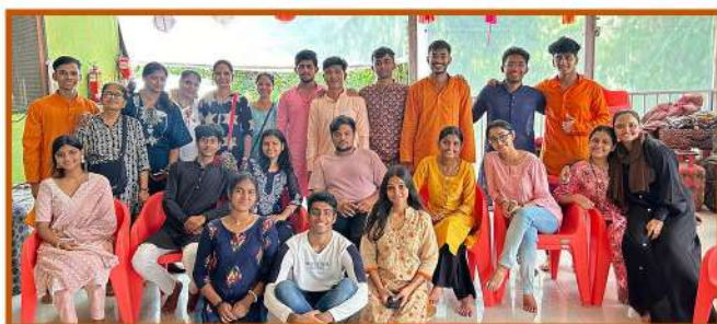
Rotaractors at Old Age Home