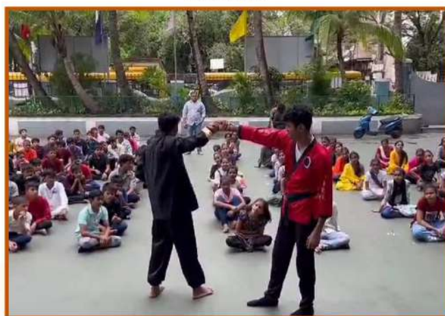
Self Defense Demonstration